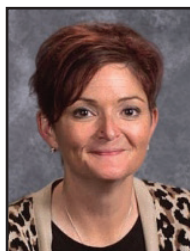
Jennifer Stewart Maxwell Intermediate