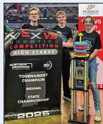
VEX Robotics State Champions