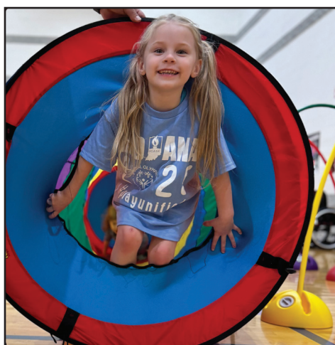
Cougar Cubs Preschool