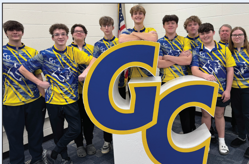
GCHS Bowling State Champions