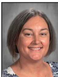
Lindsey Ferree Greenfield Intermediate