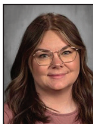
Becca Rogers Harris Elementary