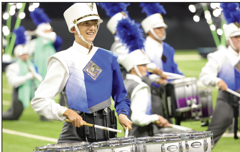
GCHS Marching Band State Champions

earn hundreds of high school credits prior to stepping foot in the high school, thus creating considerable flexibility for their high school scheduling. Greenfield-Central's high school students achieved state championships in marching band (the 3rd time in the last five competitions), VEX Robotics, and bowling. Beyond those accolades, our seniors in men's basketball and football tallied more wins in their four years of high school than any of their predecessors in the last 56 years in our school's history. Our award-winning music and drama programs all had multiple opportu-