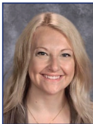
Amy Schwartz Greenfield Intermediate Resource