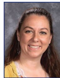
Annie Wing Weston Elementary Second Grade