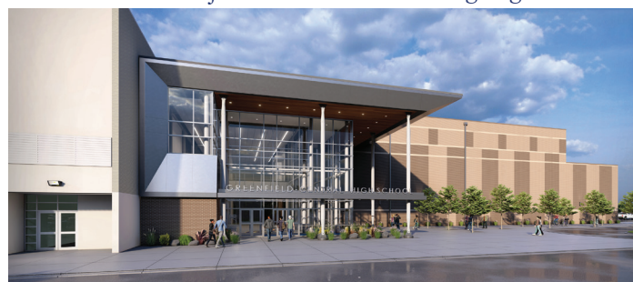
Construction on the new auditorium should begin around fall break.

As I reflect on the lengthy history of our schools, I conclude that there may be no better time to be a Greenfield-Central Cougar. It is with great confidence that I assert that we have more greatness ahead of us. I hope you share in my optimism for our school community, and I look forward to your continued support as we strive for ongoing successes.