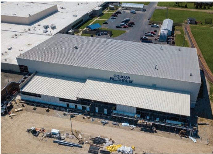
The G-CHS Performing Arts and Athletic area

One of our major reasons for this excitement is our new Athletic and Performing Arts areas.