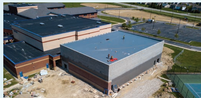
The Greenfield Central Junior High School has an additional gym and new parking area.