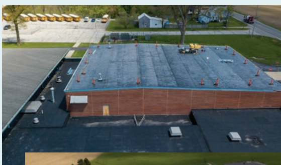
New roofs were installed at Maxwell Intermediate School and J.B. Stephens Elementary School.

Several planned construction projects at different locations around our schools were still able to move forward while students were not in the school buildings.