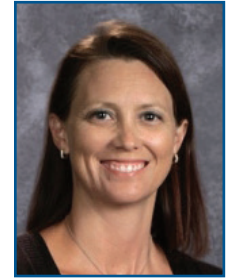
Kathy Lee Weston Elementary School Grade 1